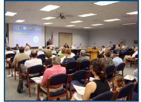
More than 40 community members attended the meeting to learn about hurricane preparation advice.